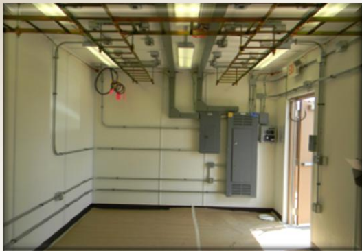
Milan Shelter with Narrow Band configuration